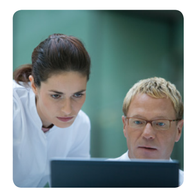
HID can create a custom tag solution to fit your application requirements for chip type, dimensions, programming and materials.